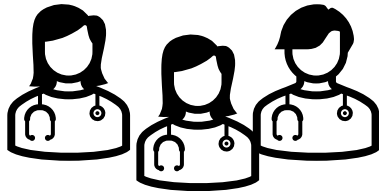
Community teams equipped with Pro devices