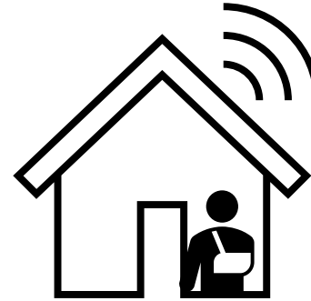
Patient provided with a TytoHome device*

Supporting long and short term conditions e.g. early discharge